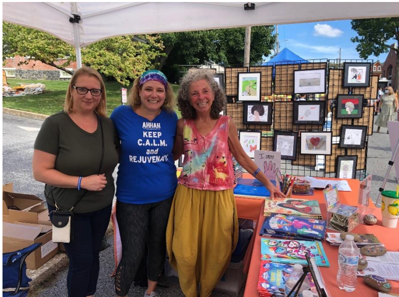
AHHAH at Kennett Mushroom Festival

Community events give us the chance to connect with our neighbors and to show our support for the work of other non-profits and community organizations.