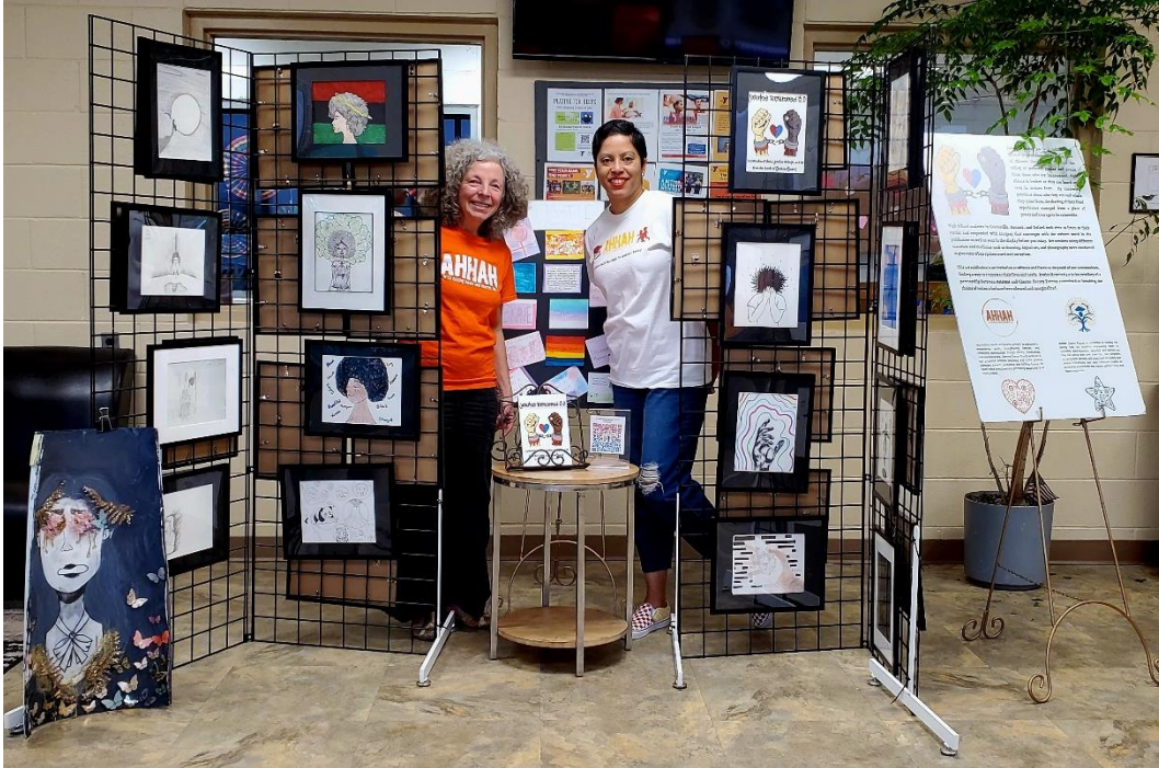
AHHAH's Restorative Justice 3.0 Traveling Art Exhibit at the Coatesville YMCA

Justice Restored Art Exhibit From November thru December 22, the Justice Restored 3.0 Traveling Art Exhibit was on display in the Emerging Artists Gallery at Oxford Arts Alliance . Justice Restored is a collaborative art project featuring the writings of young people ages 10-18 incarcerated in the Chester County Youth Center, interpreted through drawings created by high school students in the Chester County Futures program. The art exhibit was at the Coatesville YMCA for the month of February for Black History Month