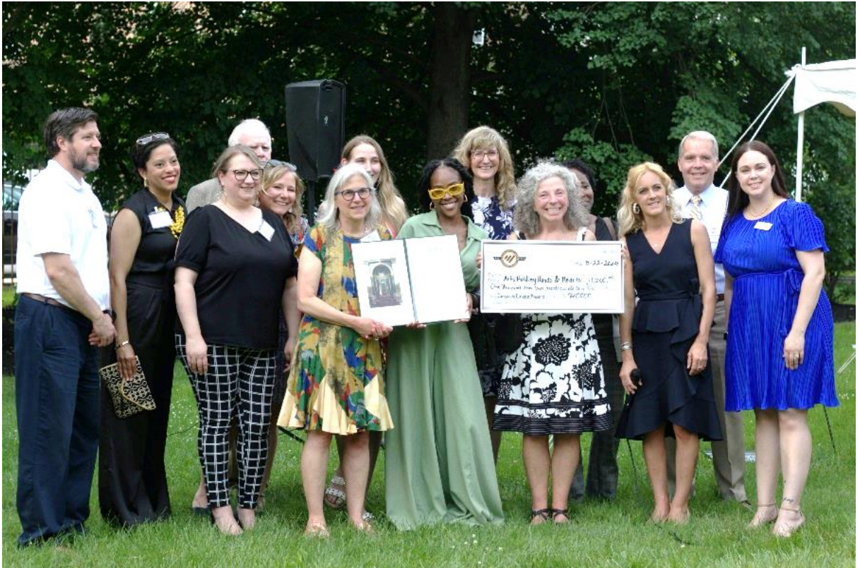
Corporate Citizenship Award Presentation

We are so grateful and honored to receive the Western Chester County Chamber of Commerce 's annual Corporate Citizenship Recognition. Since 2012, the Chamber of Commerce has awarded the Corporate Citizenship Recognition annually to local non-profit organizations for their work and dedication to the community. AHHAH received the award at this year's 2024 Gala on the Greene, a celebration featuring local vendors and community organizations at historic Greystone Mansion in Coatesville.