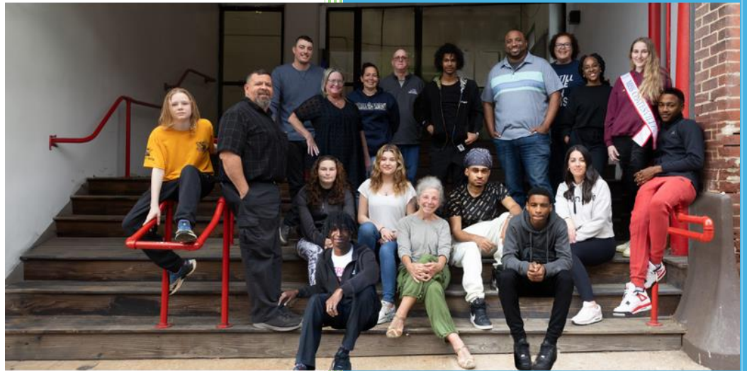
AHHAH Filmmaking students and teachers