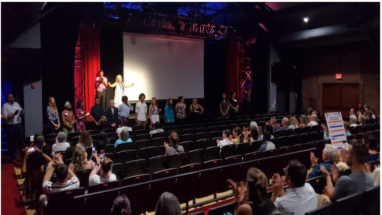
Restorative Justice Open House

The event featured the first public screening of the eight-minute documentary trailer created by our filmmaking students as well as the Restorative Justice 3.0 Traveling Art Exhibit. The filmmaking program and the Open House was supported by a PECO Powering the Arts Grant