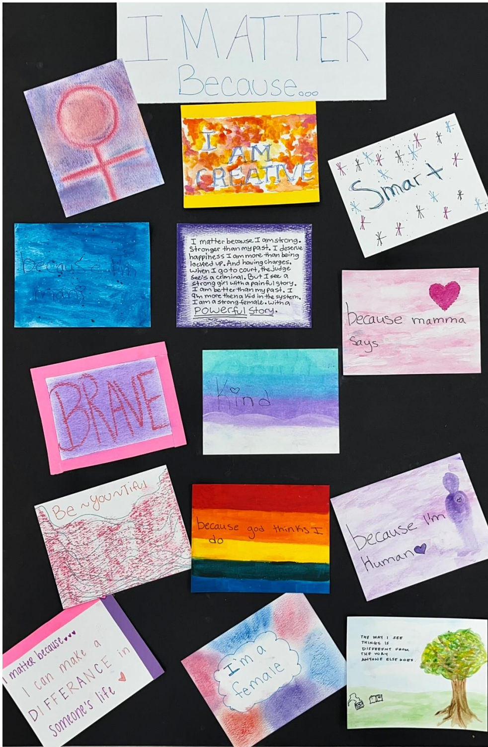
I Matter Board created by girls in detention at Chester County Youth Center